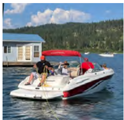
Getting ready to tube!