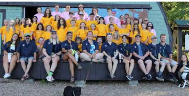
Counselors, campers and staff from Intermediate Camp.