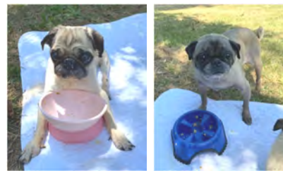
Pugs Gigi & Max enjoyed the meals at Camp!