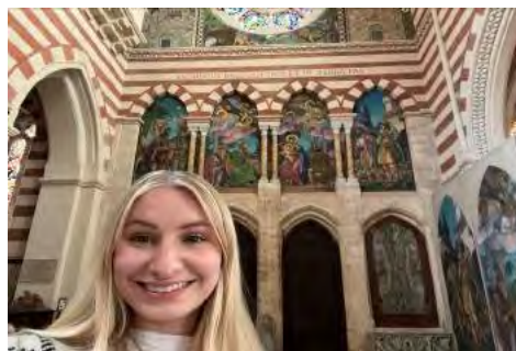
St. Paul's Within the Walls Church in Rome,