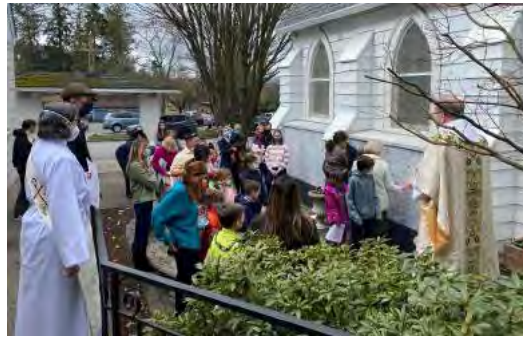
The family service moved outside to the columbarium for the reading of the Gospel lesson on Easter Sunday.