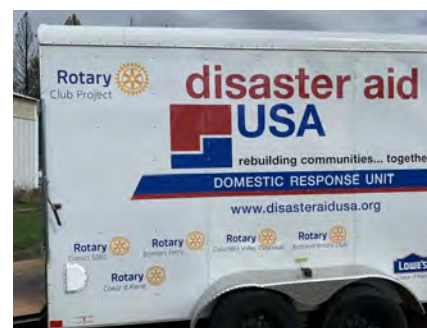
The Rotary Disaster Aid trailer.