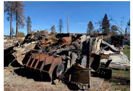
A pile of metal ready for pickup by FEMA.