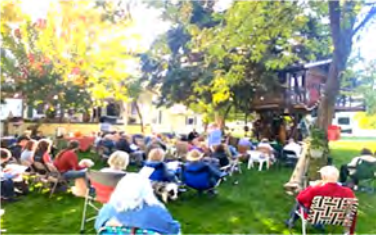
A large crowd enjoyed a beautiful morning.