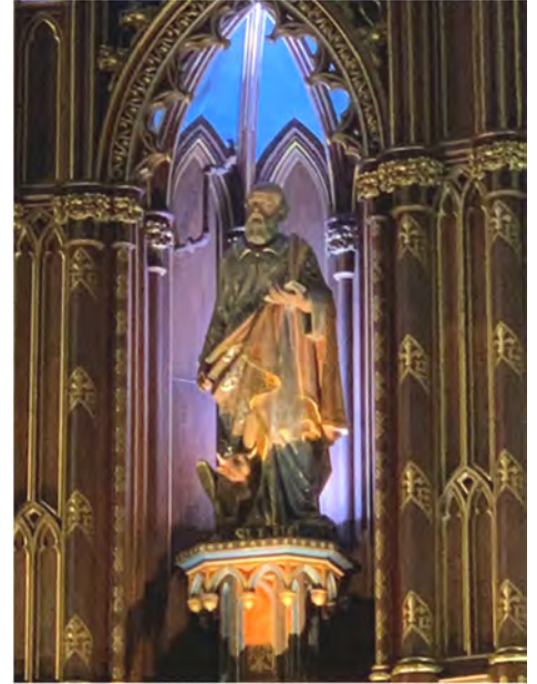
St. Luke watching over the altar and the worshippers in the Notre Dame Basilica, Montreal.