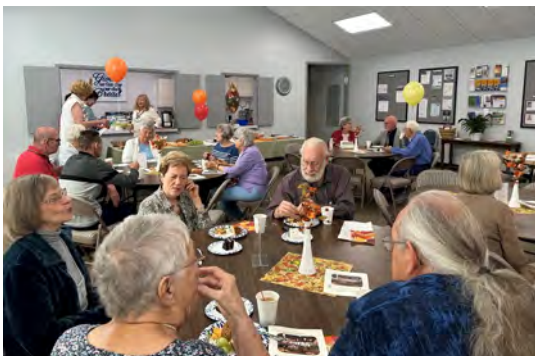
There was a great turnout for the event!