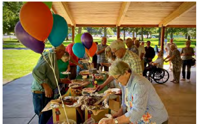
A great time was had by all at the annual service in Coeur d'Alene City Park, which was followed by a potluck featuring delicious fried chicken provided by St. Luke's Men's Group.