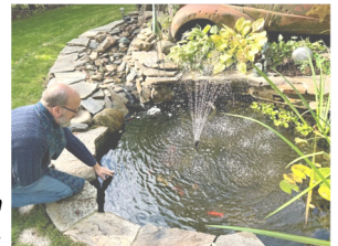
Even the goldfish received a blessing.