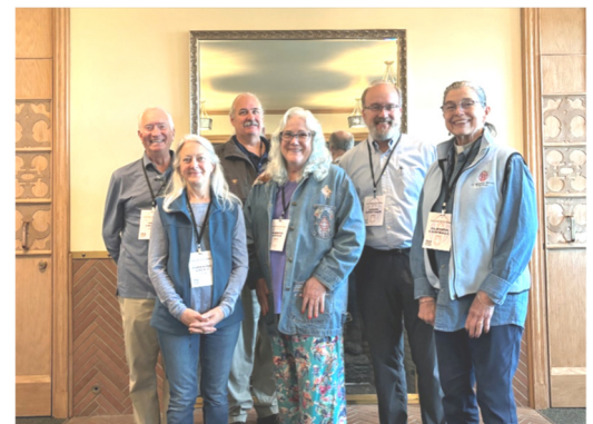
St. Luke's delegation to the 60 th Annual Diocesan Convention, October 18-20.