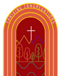
BUILDING BRIDGES; HEALING DIVIDES

As reported previously, the Building Bridges: Healing Divides initiative for our second year is largely focused on developing a ministry experiment for our congregation to participate in this fall and into next year.