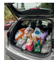
A large carload of donations were delivered to St. Vincent de Paul for the September offering.

Please take a slip of paper from the little basket at offering time to see what specific items are most needed for our smaller local food banks. We generally collect non-perishable foods, basic hygiene supplies, laundry detergent, and pet food. Church members deliver the food at the end of the month. If you have questions or would like to help with delivery, contact Barbara Webb (208-651-2405).