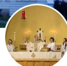
St Luke's Episcopal Church