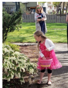
St. Luke's kids enjoyed the Easter Egg Hunt on April 19.