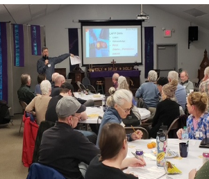
Fifty-four people from St. Luke's and the community attended the Braver Angels training on March 24.

The last couple of months were BUSY at St. Luke's! From the Braver Angels training to Holy Week, to the Easter Egg Hunt, baptisms and a renewal of wedding vows, learning and celebrations abounded!